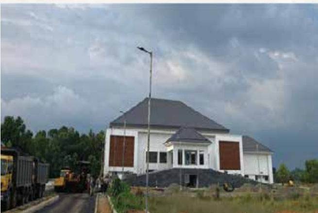
VIJAYA CONVENTION CENTER Thiruvalla