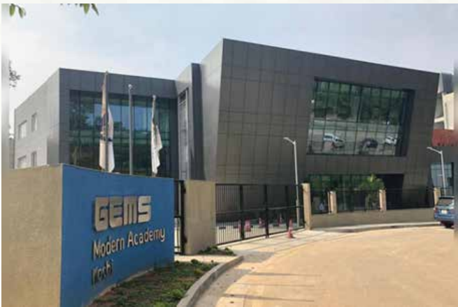
GEMS MODERN ACADEMY AND INTERNATIONAL SCHOOL, Kakkanad