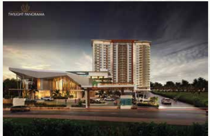
HEALERS HAVEN by TIDA, Thalassery ——— ○ ● ● ● ● ● ● ● ● ● ● Apartment + Club House/Convention Centre 420000 Sft.