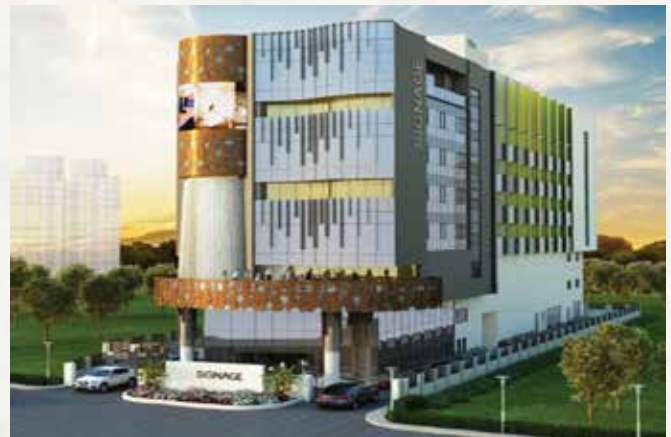
STAR HILL APARTMENT HOTEL ——— ○ ● ● ● ● ● ● ● ● ● ● 4 Star Hotel 120000 Sft.