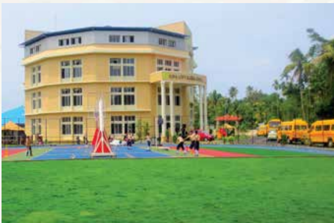
AURA EDIFY GLOBAL SCHOOL, Kodungalloor ——— ○ ● ● ● ● ● ● ● ● ● ●