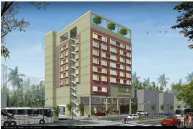
HOTEL TRANSIT by THE MAMMUS GROUP, Palakkad ——— ○ ● ● ● ● ● ● ● ● ● ● Four Star Hotel 70000 Sft.