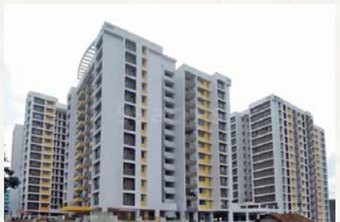
SFS SILICON PARK