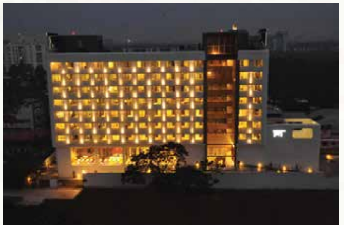
KEYS HOTEL, Kochi