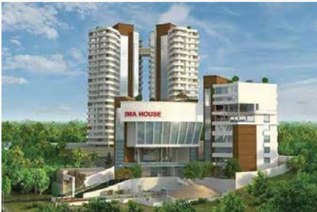
IMA DOCTOR'S ENCLAVE, Manjeri ——— ○ ● ● ● ● ● ● ● ● ● ● Apartment Project 450000 Sft.